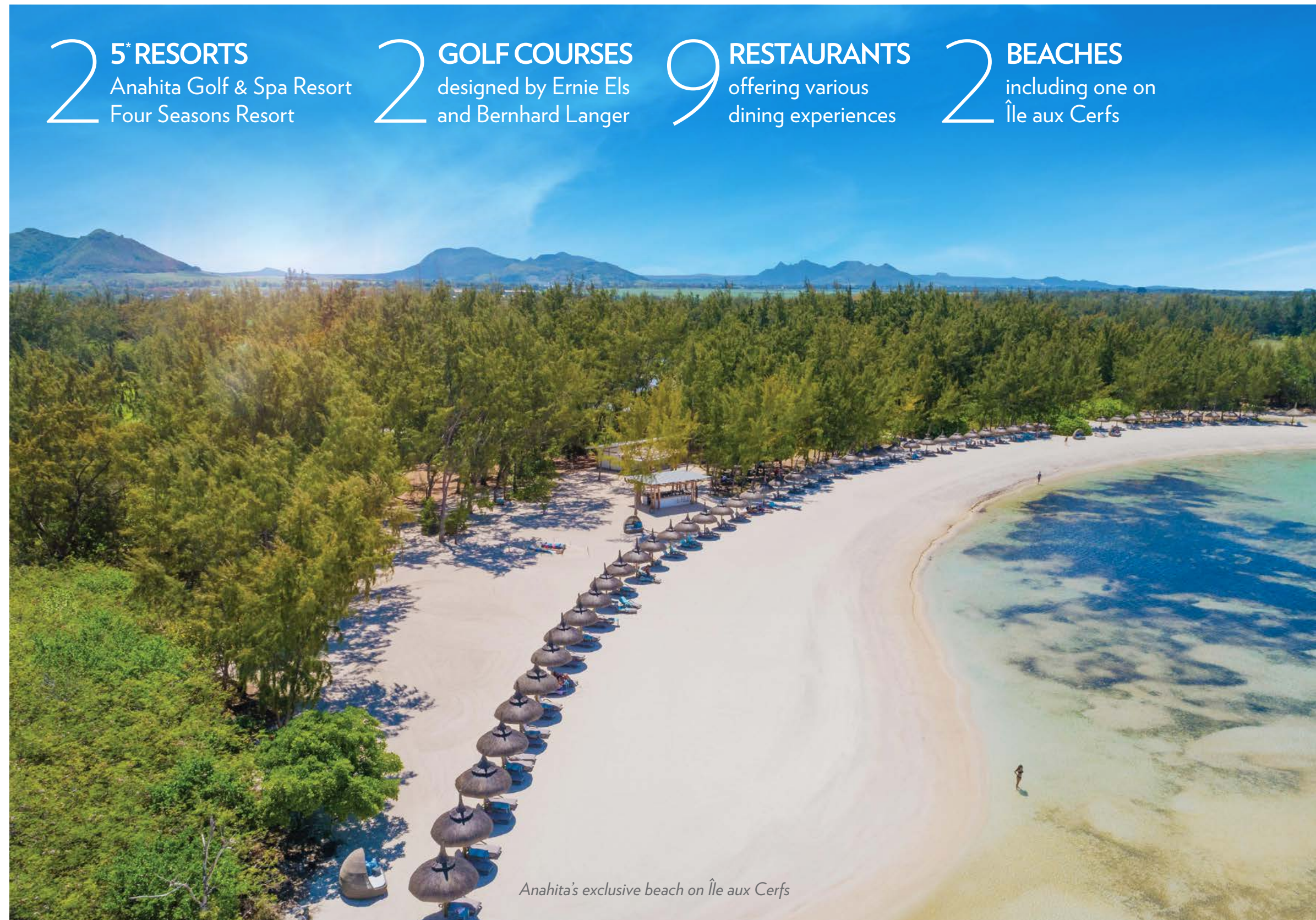
Anahita's exclusive beach on Île aux Cerfs

2 BEACHES including one on Île aux Cerfs