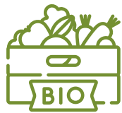
Bio Farming Methodology